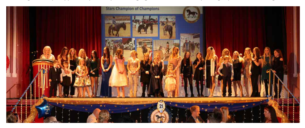
Image kindly supplied by BobbyJo Imaging who will be our photographer on the night

Ticket form available on our website from September 2024